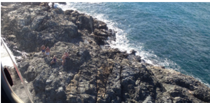
Keswick Island residents stranded on Silloth Rocks