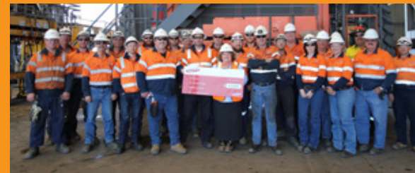
NRW - Middlemount Mine

For more information or to arrange a presentation in your workplace call the RACQ CQ Rescue office on (07) 4998 5232 or 0427 578 182.